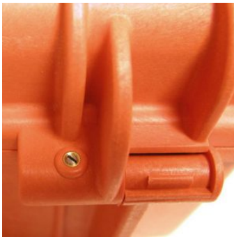
LID CAN BE SET TO SLIDE-OFF By releasing the back screw, lid becomes set to slide-off when opened at 70°