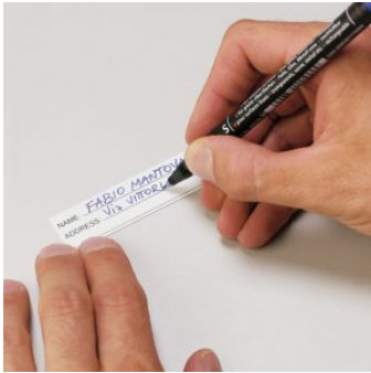
PVC WATERPROOF I. D. REMOVABLE LABEL (Art. LABELCOVER + nr. art.)