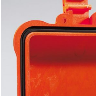
SEALING O-RING (Art. NEOSEAL + nr. art.)