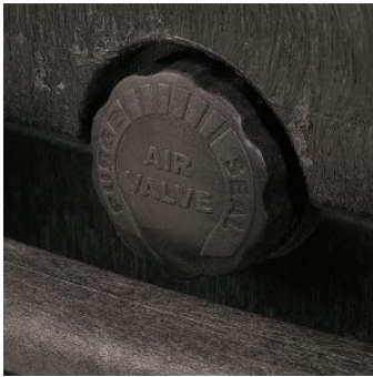
MANUAL PRESSURE RELEASE VALVE The internal stop ring prevents valve from being completely extracted (Art. PURGEVALVE.B)