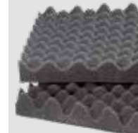
RED2712.BCV Black with convoluted foam