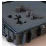
RED3005.B Black with pre-cubed foam