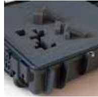
RED2712.B Black with pre-cubed foam