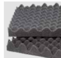
RED3005.BCV Black with convoluted foam